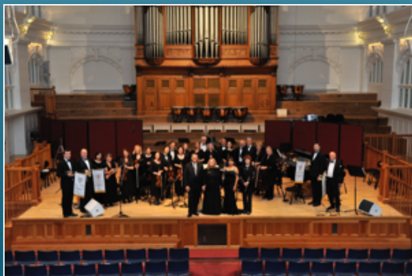
Musique Sur La Mer Orchestra